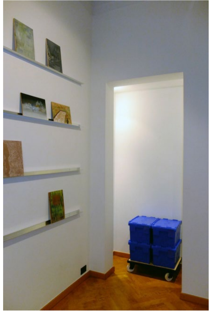
I Told You So The World Is Flat, Galerie Fortlaan 17, November 2013