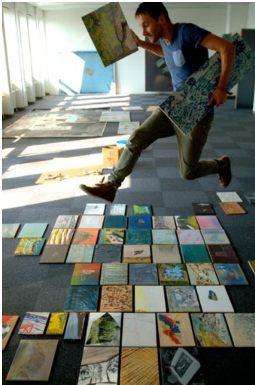
w-o-l-k-e, Vaartstraat 45, Juni 2013