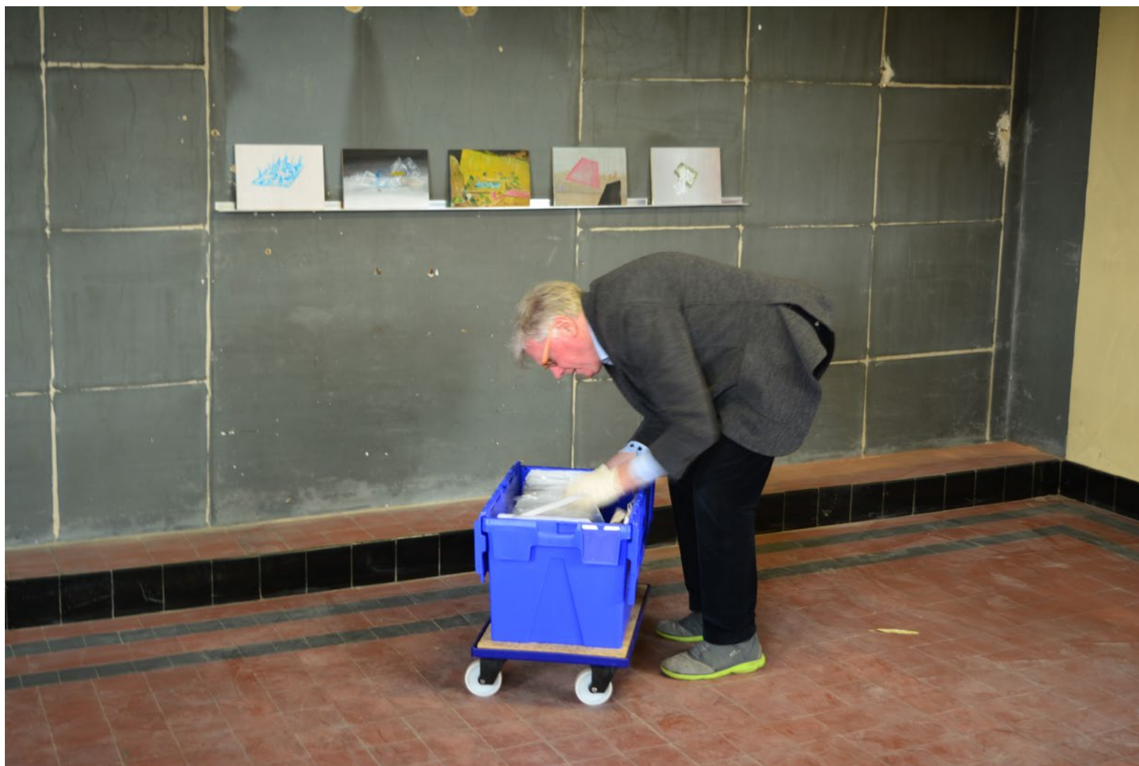
SECONDRoom, April 2017