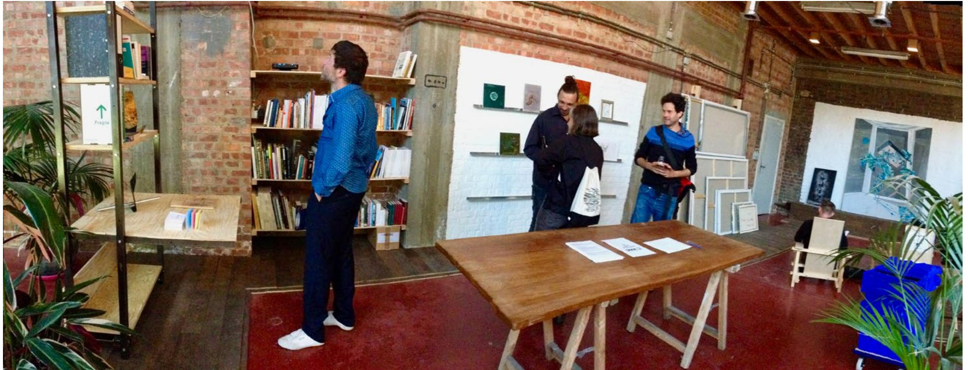
w-o-l-k-e, FESTIWOL, Juni 2017