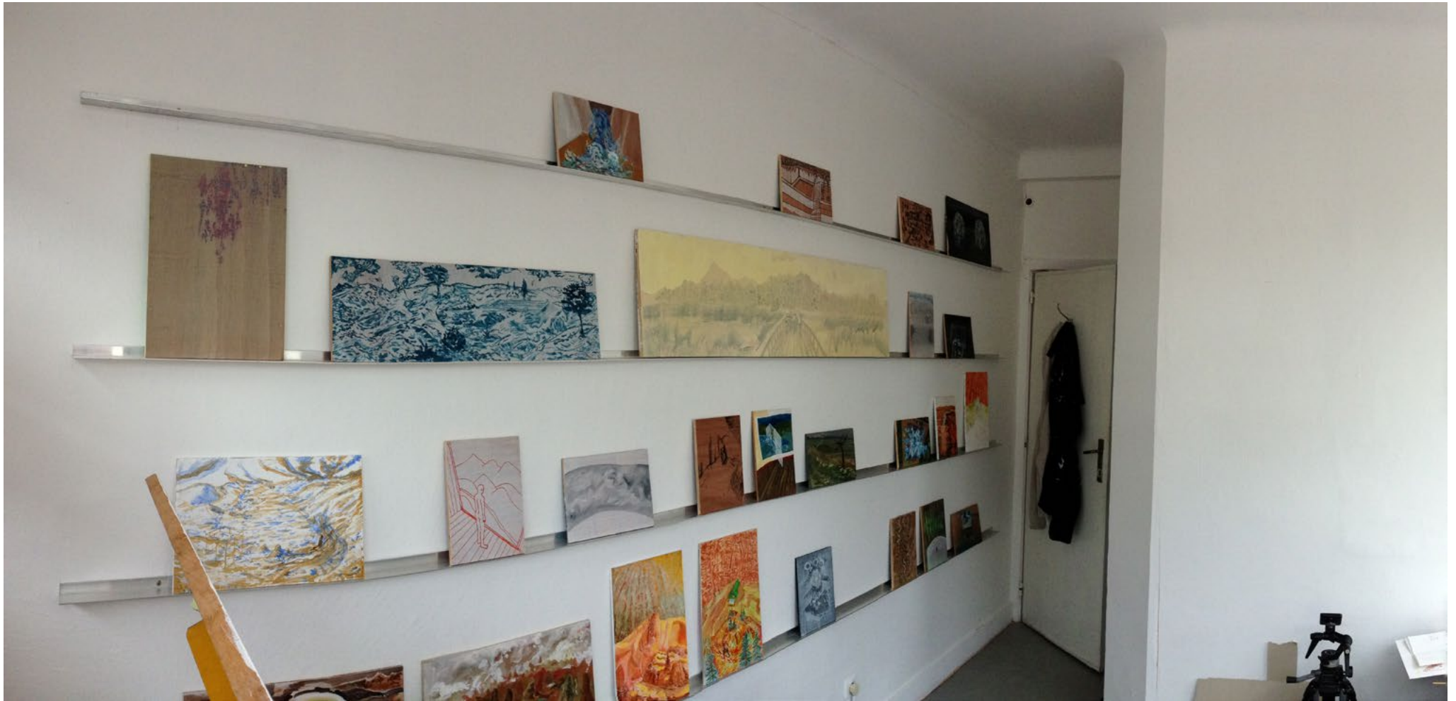
w-o-l-k-e, Sonart studio, December 2015